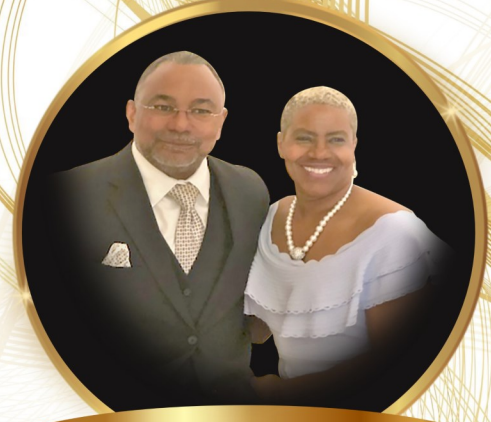
32nd Pastoral Anniversary

May, 28th ~ 8:00 a.m. JUBILEE CELEBRATION